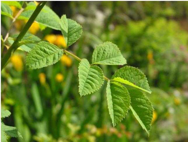
Dog Rose .....